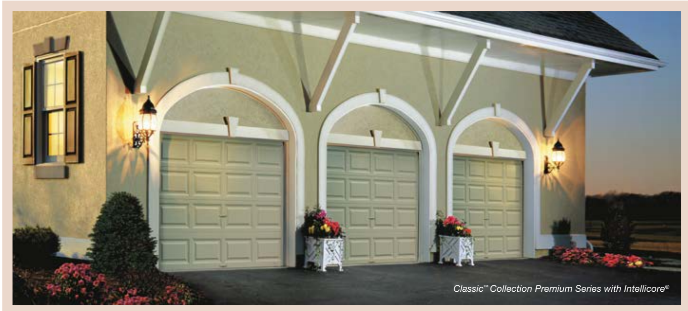
Classic™ Collection Premium Series with Intellicore®