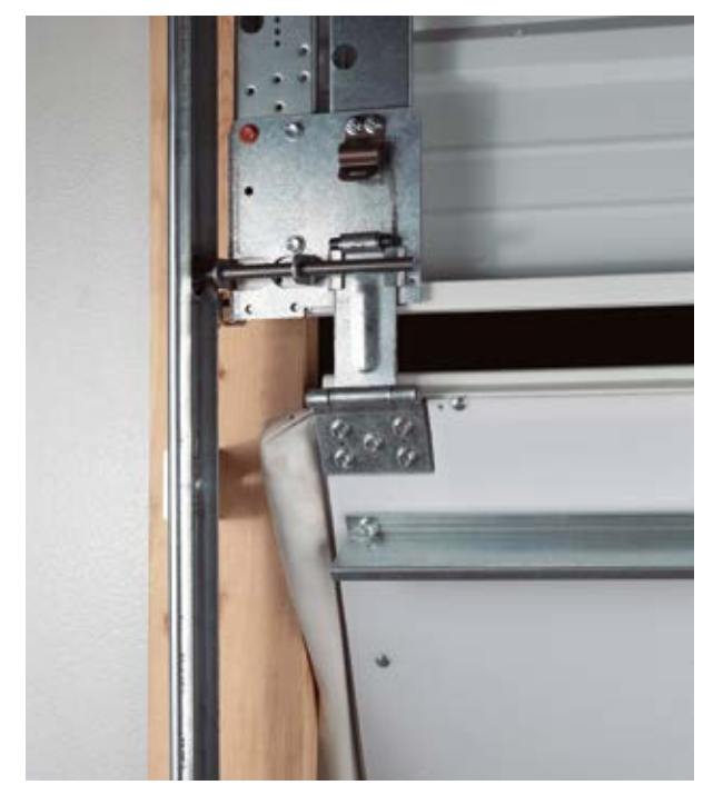
Inside View of Single Bottom Section

Clopay's break-away bottom sections will release from the track and swing up to a full 45° angle inward or outward, preventing further damage to the door. The cable attachment at the bottom of the second or third section enables the door to continue operating after being struck. The bottom sections can be snapped back into place in less than a minute. The bottom sections have a fiberglass or polycarbonate sheet on the inside of the sections to resist dents and maintain an attractive appearance. These sections are available on the 1-3/4" (44.5 mm) and 2" (50.8 mm) thick 3000 Series polystyrene and polyurethane insulated doors, and on all 520 and 524 Series ribbed steel doors.